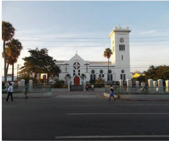
The Kingston Parish Church