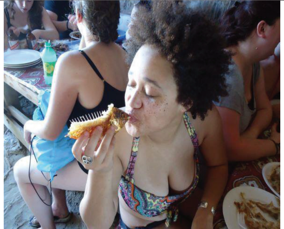
Volunteer enjoying fish