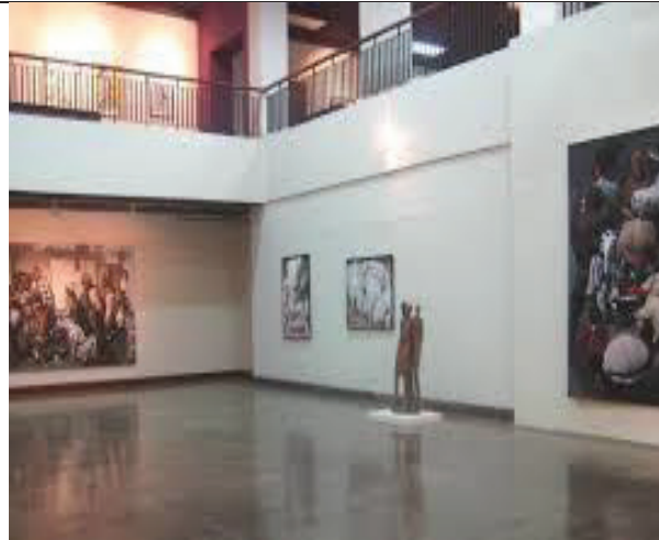
The National Art Gallery