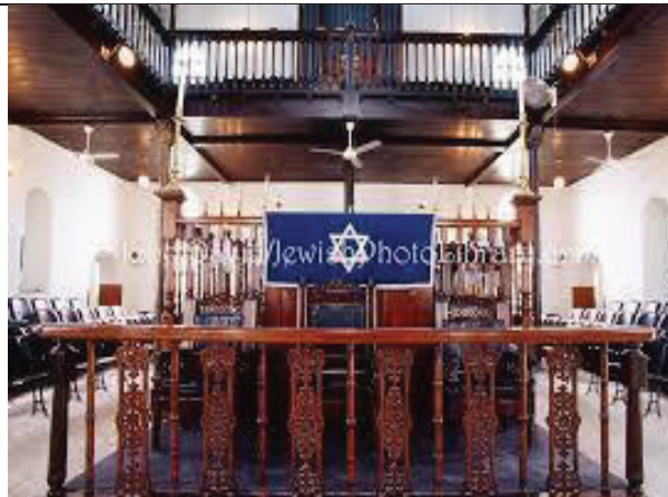
Inside the Jewish Synagogue