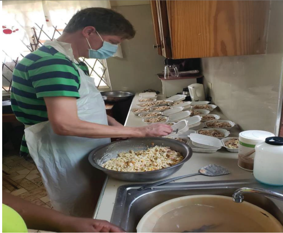
Volunteer in Soup Kitchen