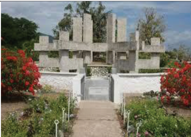
The National Heroes Park