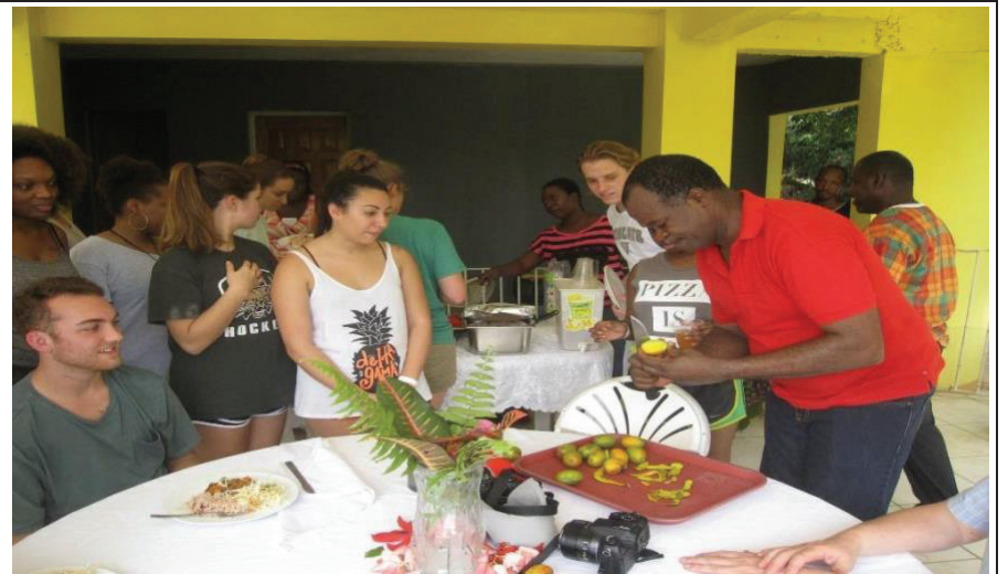
Demonstration of peeling June Plums for Ohio Students in Beeston Spring