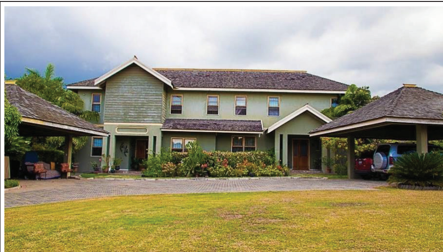
THE INN AT 6