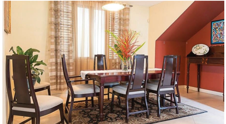
THE INN AT 6