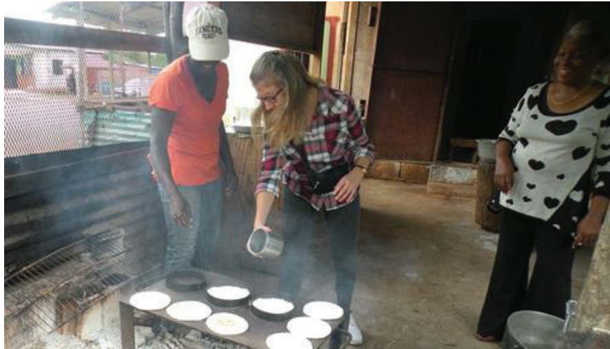
Visitor making bammy in Resource Village Manchester