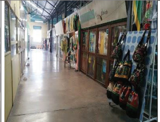
The Kingston Craft Market