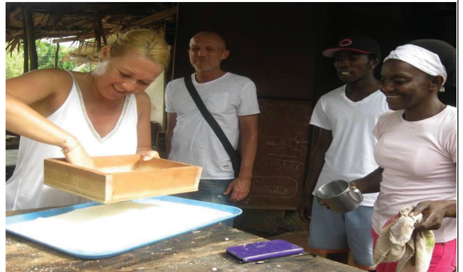
Bammy making with guest in Resource Village