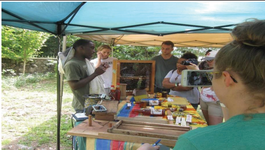
Bee Keeping visit, Ohio students, Beeston Spring