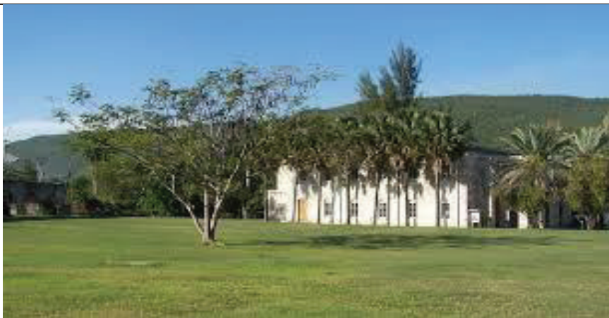
Chapel on UWI Campus