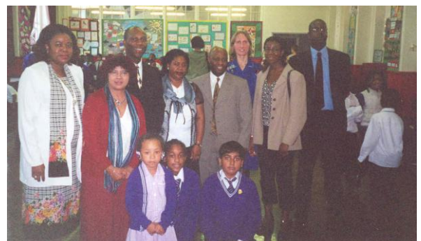
Nursing Futures: Leopold Primary School, London NW10 (RCN Connect/LEN Partnership)

Practitioners involved in RCN Connect has identified an area of professional lead, aligned with National Service Framework principles with a focus on addressing "inequalities" in their chosen area, as identified in the NHS Plan screening programmes (e.g. sickle cell anaemia, diabetes, leukemia, lupus, older people, glaucoma, cancer, stroke, hypertension, mental health and sexual health). By bringing together the key factors of (a) RCN resources (members, officers, branches, forums and networks) and (b) a community/voluntary organisation, they are able, through targeted media activity, political support and meetings, to deliver appropriate remedies to their local communities.