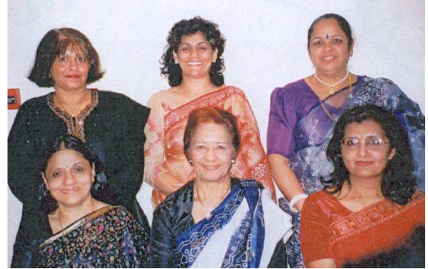
Sanskriti Mahila Mandal Committee