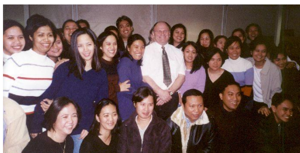
RCN Wales: International Evening

Like other parts of the UK, Wales has suffered from the effects of nursing shortages. Most NHS Trusts have tried various creative means of recruiting ( although much still needs to be done ) and have turned to International Recruitment as a desperate option.