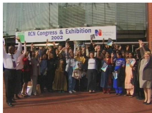
West Midlands Region

Over 200 VHS copies have been distributed throughout the UK Health and Care sectors. Copies are available from RCN Regional offices, Resource Centres and Libraries.